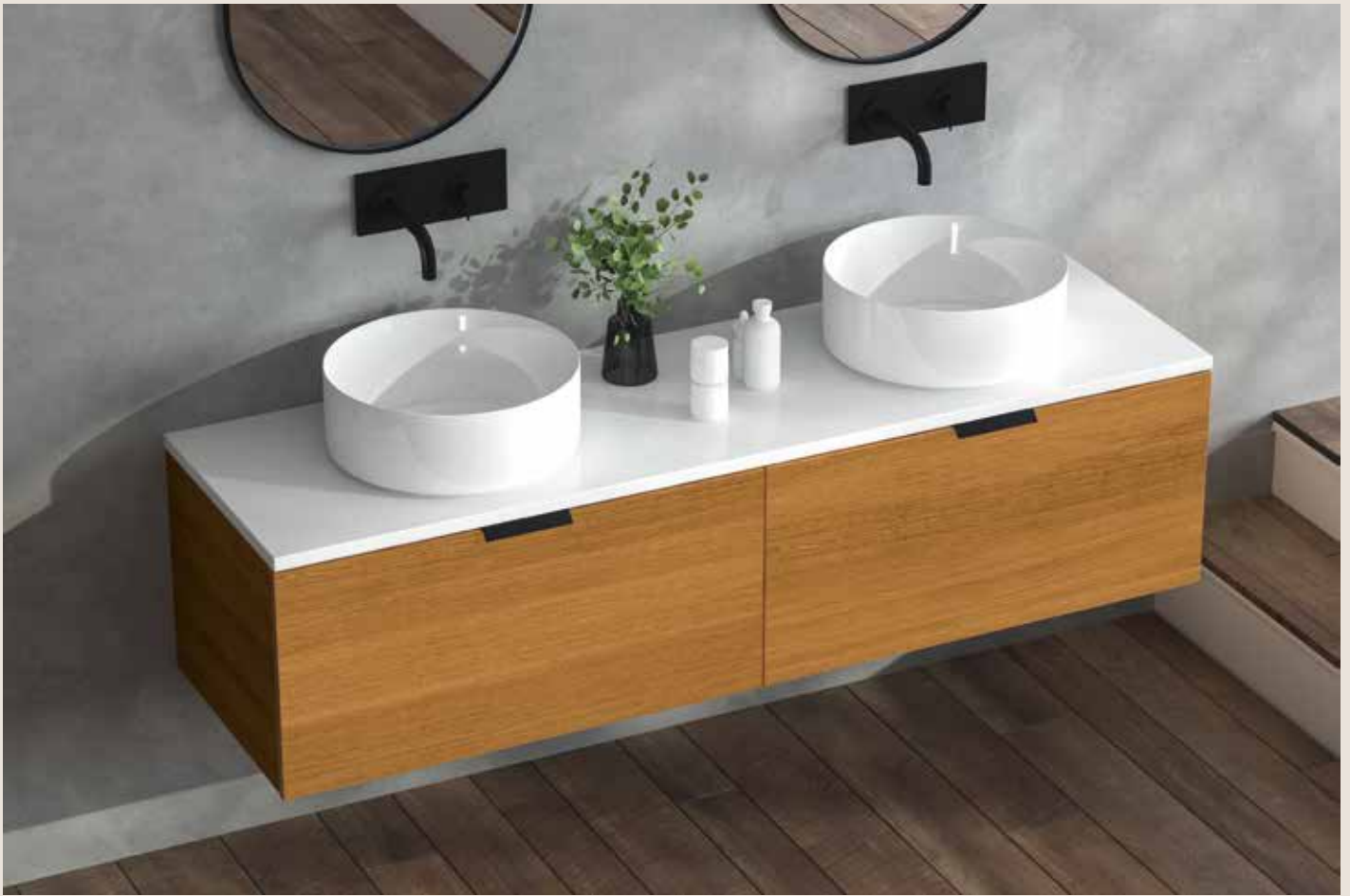
sample for VM501