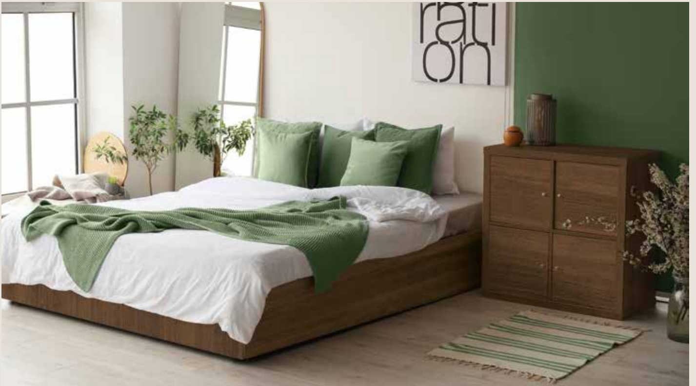
*Colors may vary, ask for samples.