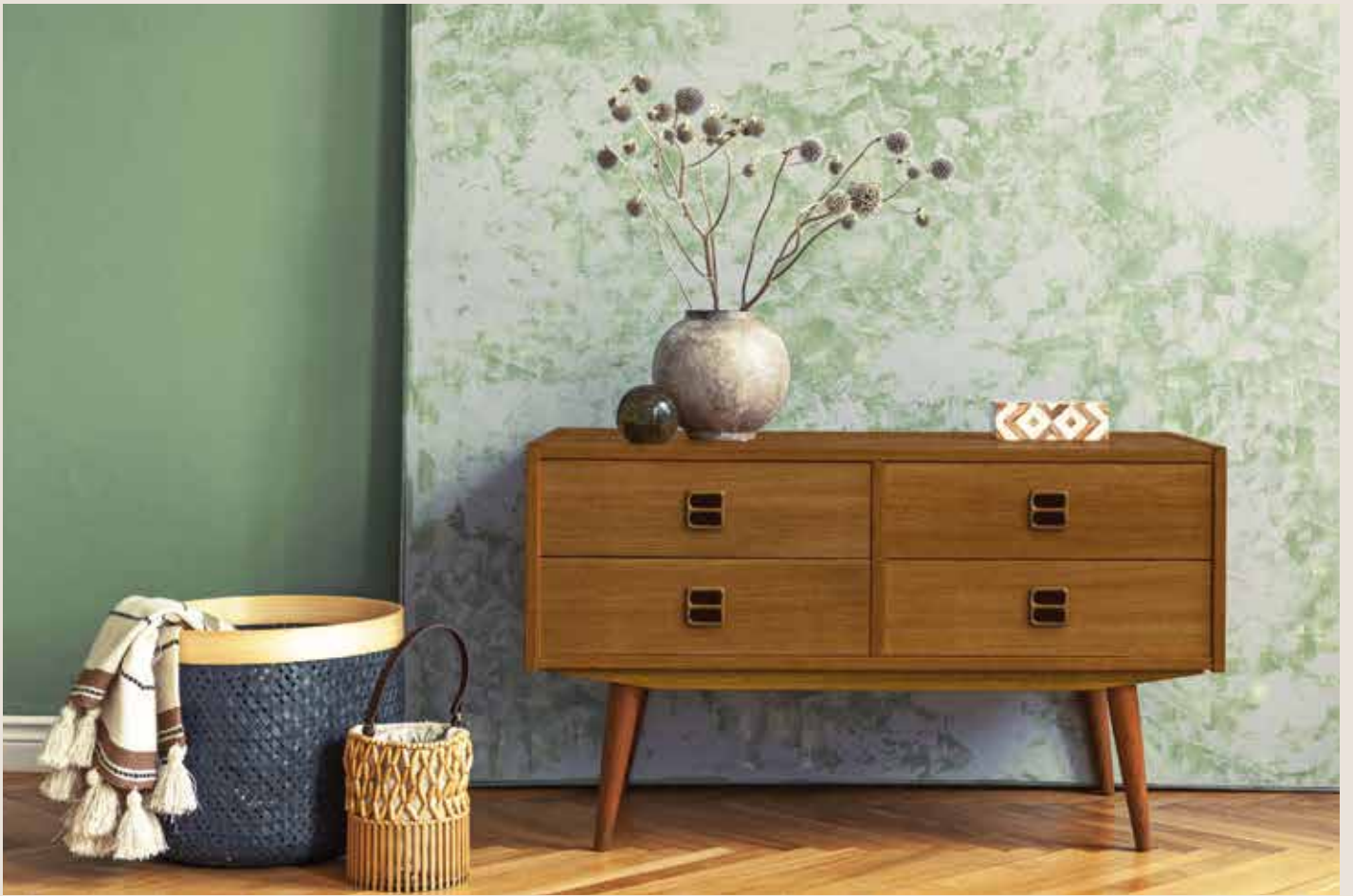
sample for VM504