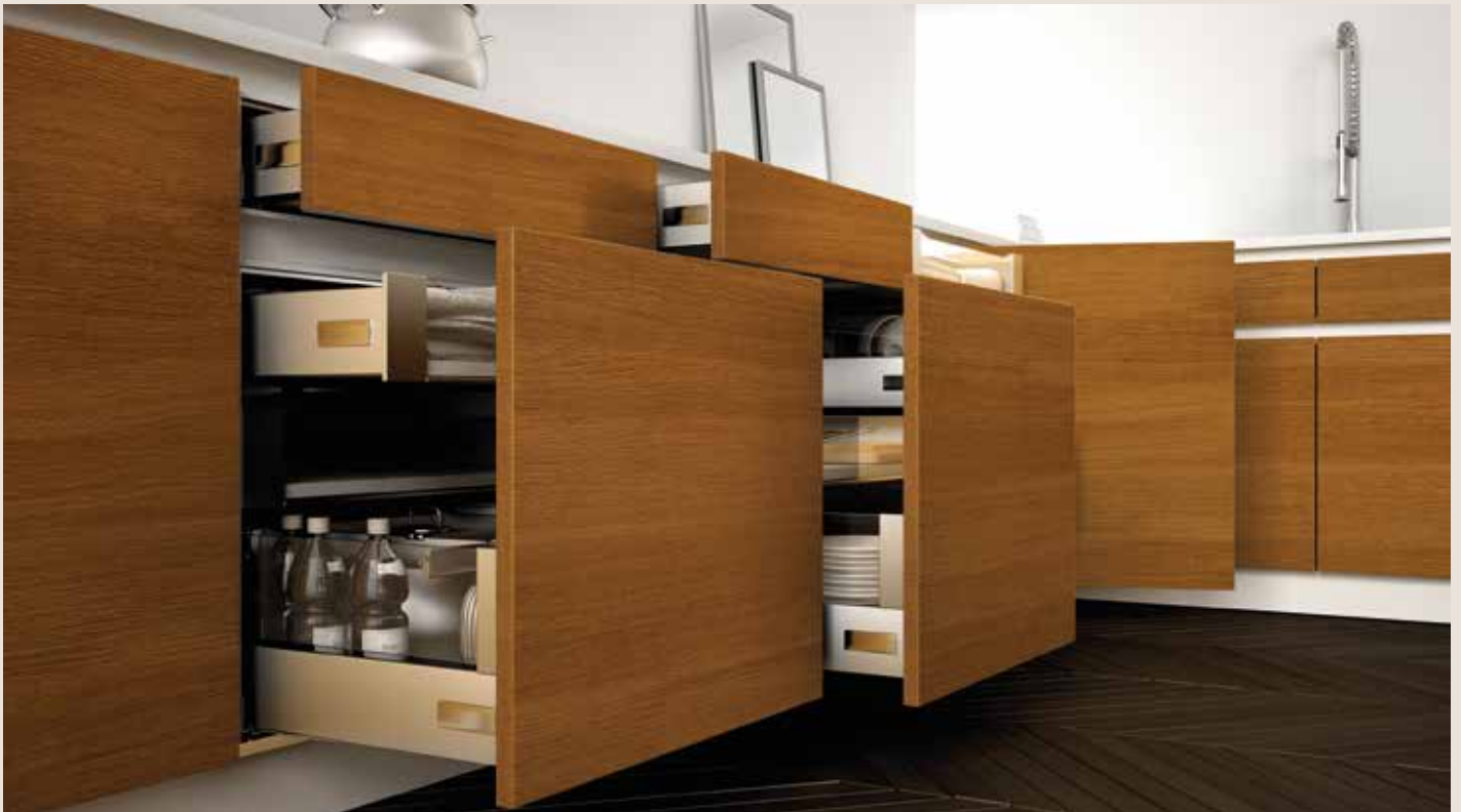
*Colors may vary, ask for samples.